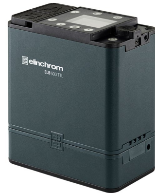
ELB 500 TTL 10232.1 + 19297