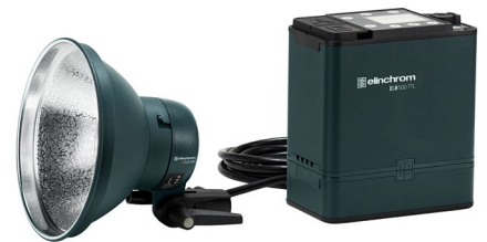
ELB 500 TTL To Go Set 10309.1

Concentrate on the story you want to tell and produce better images in just a few steps.