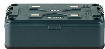
ELB 500 Battery 19297