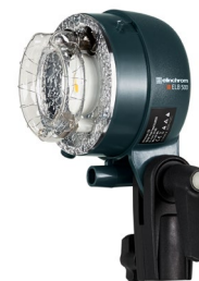
ELB 500 Head 20190