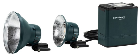
ELB 500 TTL Dual To Go Set 10310.1