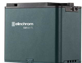
ELB 500 (without battery) 10232.1